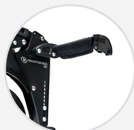
Quick release handles to activate and release