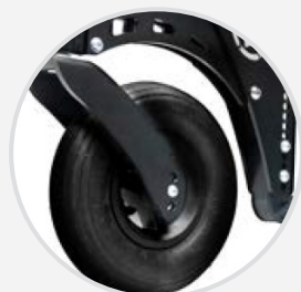
200x50 pneumatic tyre with anti-flutter fork