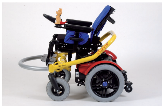
Electrical backrest angle adjustment