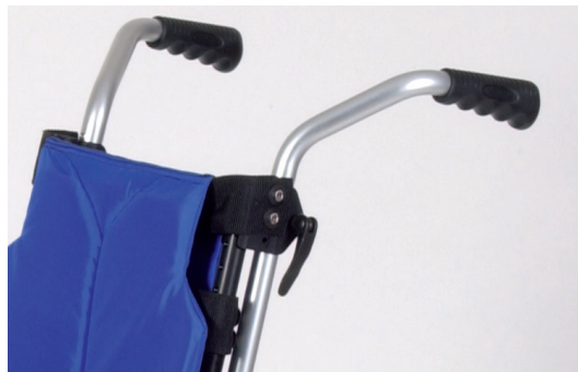
Height adjustable push handles for attendant