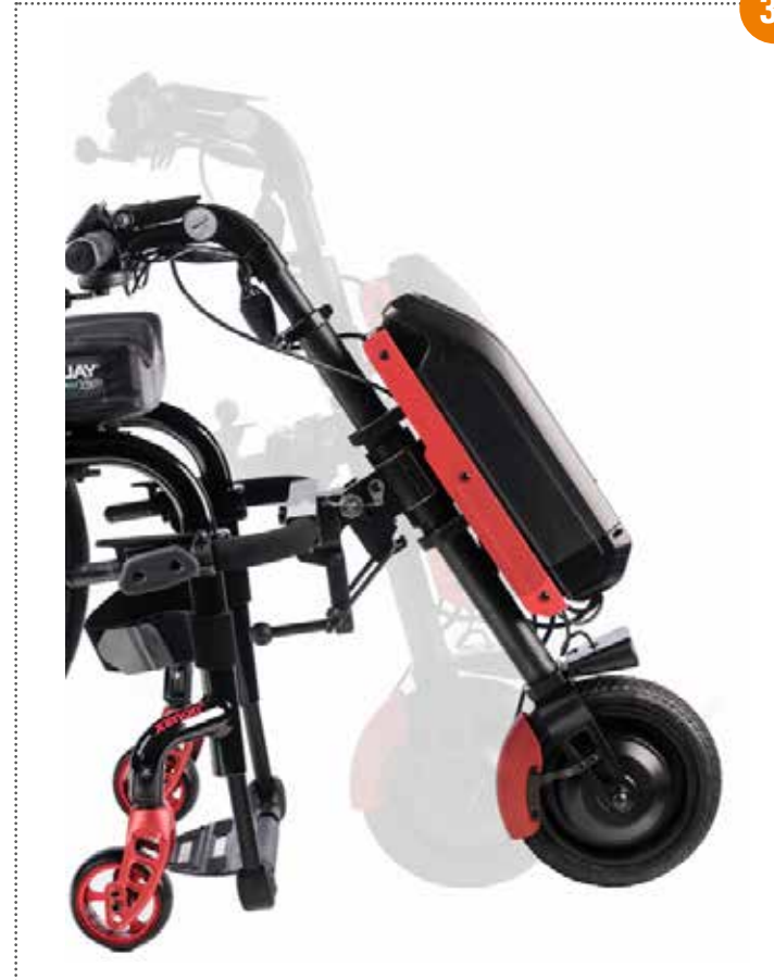
Step 3 - Turn the locking pin and with either one or two hands push the bike up until you hear a click