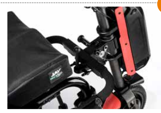
Step 4 - Lift the clamp to remove the play between the bike and the chair for a smoother ride

Once docked the F55 is light to push up, lifting the front castors off the ground. Ideal even with limited strength.