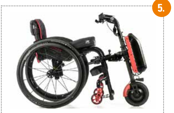
Step 5 - Once mounted simply turn the F55 on and off you go!

The lift clamp is designed to reduce the play that exists between a chair and an add-on device, meaning you can feel safe and secure in your F55.