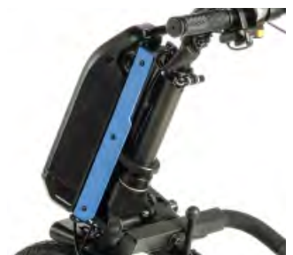
Colour-kit (sidebars) included in delivery (accent colour blue)