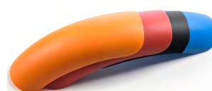
Colour-kit (mudguard) included in delivery