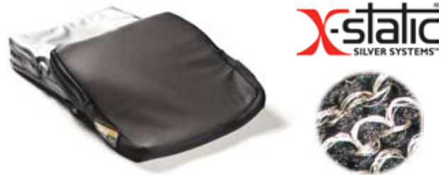
Outer and inner cover