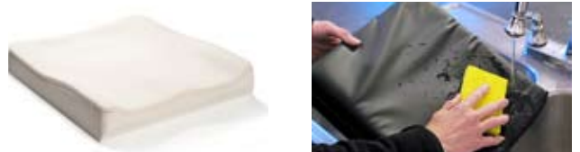
Dual layered contoured foam base