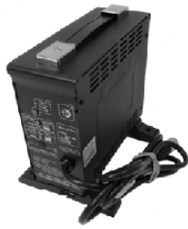
// QZT160100 & QZT160101