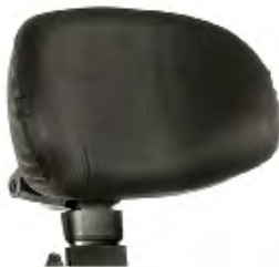
// QZT030430 & QZT030431