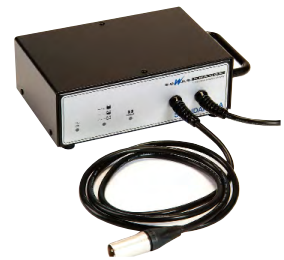
// QZT160103 & QZT160104