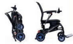
Q50 R Carbon