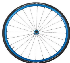
Lightweight wheel, anodized blue