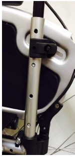
Backrest tube, aluminium