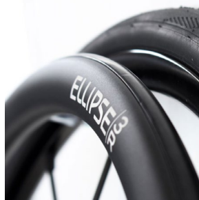
Ellipse 3R Handrim