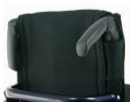
Push handles, fold-down