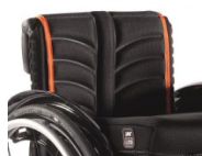
EXO PRO backrest sling