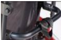
Stabilizer bar, automatic folding