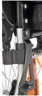
Backrest, angle adjustable