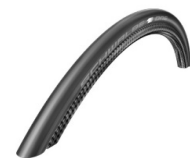
Tyre, pneumatic, slick, Schwalbe One