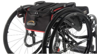
Backrest, fold down (to the front)