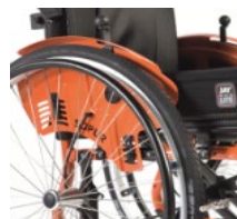
Push to lock brake, integrated in sideguard, Safari