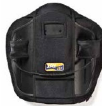
Jay Zip Back