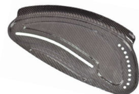
Carbon fibre sideguard, fender, wet weatherprotection (black)