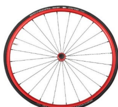
Lightweight wheel, anodized red