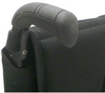
Push handles long