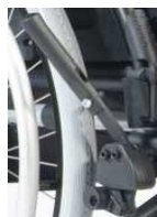
Push to lock brake, one- arm, right actuation