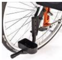
Crutch holder, loop