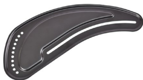
Aluminium sideguard, wet weatherprotection (in frame colour)