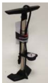
High pressure pump