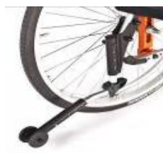
Anti-tip tubes, swing- away, left