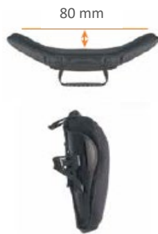
Jay 3 Back Mid Contour