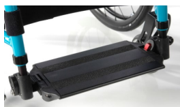
Footboard, angle and depth adjustable; flip up, aluminium with locking system