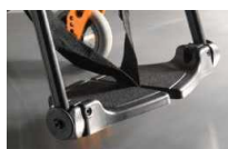
Footboard, divided, composite, angle- adjustable, flip-up (sideways), heel loop, black