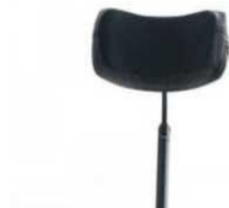
Headrest, height, depth and angle adjustable