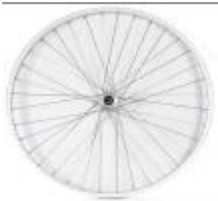
Rear wheel, Universal, 36 spokes, cross-wise spokes