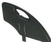
Composite sideguard, removeable (black)