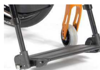
Footboard, platform, lightweight, plastic, angle & depth- adjustable flip up (sideways), calf strap, black