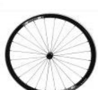
Rear wheel, Proton, 24 spokes, straight spokes