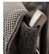
Without push handles,