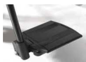
Footboard, divided, aluminium, angle- adjustable, flip-up (sideways), heel loop, black