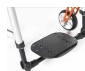
Footboard, platform, lightweight, plastic, angle & depth-adjustable flip up (sideways), calf strap