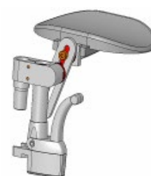
Amputee Support Pad