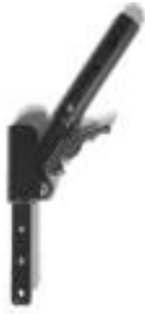
Backrest, half folding (to the back)