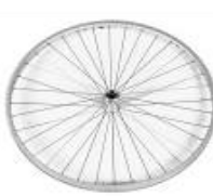
Rear wheel, Design, 36 spokes, straight spokes