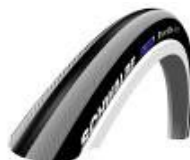
Tyre, pneumatic, fine profile, Schwalbe Right Run