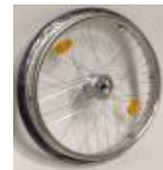
Rear wheel, drum brakes, 36 spokes, cross- wise spokes