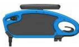
Desk sideguard, armrest, fixed, flip-up, remove