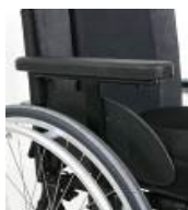
Single-post sideguard, armrest, height-adjustable, remove