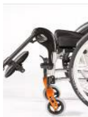
Elevating legrest (ELR)