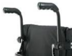
Push handles, height-adjustable