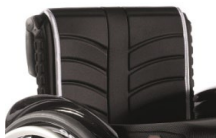
EXO backrest sling