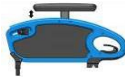
Desk sideguard, armrest, height-adjustable, flip-up, remove