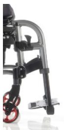
Aluminium hanger, 90°