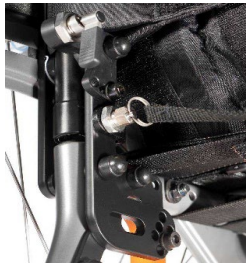
Backrest, angle adjustable