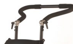
Push bar, height- adjustable, width and angle- adjustable