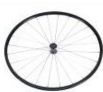
Rear wheel, Lightweight, 24 spokes, straight spokes