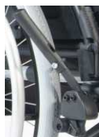
Push to lock brake, one- arm, right actuation