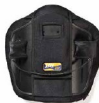
Jay Zip Back