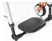
Footboard, platform, lightweight, plastic, angle & depth-adjustable flip up (sideways), calf strap