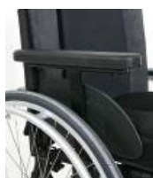
Single-post sideguard, armpad, height-adjustable, remove