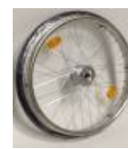
Rear wheel, drum brakes, 36 spokes, cross- wise spokes