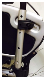
Backrest tube, aluminium Austauschen Life T