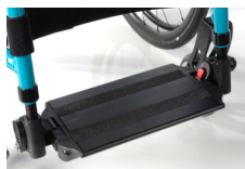
Footboard, angle and depth adjustable; flip up, aluminium with locking system