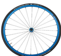
Lightweight wheel, anodized blue