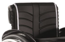
EXO backrest sling