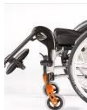
Elevating legrest (ELR)