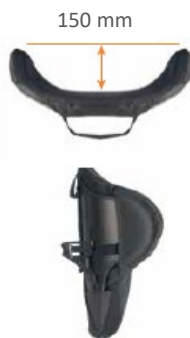
Jay 3 Back Deep