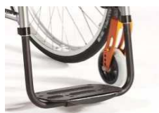
Footboard, platform, lightweight, plastic, angle and depth- adjustable, calf strap, black