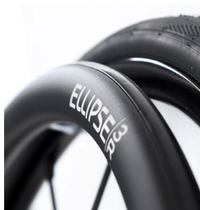
Ellipse 3R Handrim