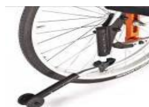
Anti-tip tubes, swing-away, left