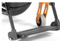
Footboard, platform, aluminium, angle- adjustable, flip-up (sideways), heel loop, black