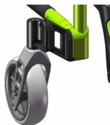
Expansion kit, designed for hemiplegic users