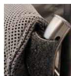
Without push handles,