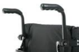
Push handles, height-adjustable