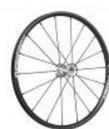
Rear wheel, Spinergy, 18 spokes (black), straight spokes; hub: silver