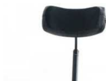
Headrest, height, depth and angle adjustable