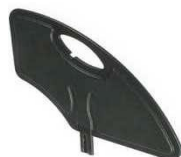
Composite sideguard, removable (black)