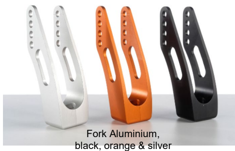
Fork Aluminium, black, orange & silver