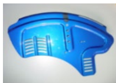
Aluminium sideguard, fender, wet weatherprotection (in frame colour)