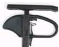
Single post height adjustable