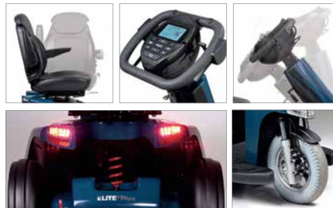
Front and rear hydraulic suspension

The central steering drive controls are angle adjustable and height adjustable using a simple adjustment in the steering column. Together with the height adjustable, 360° swivel seat, seat slider and adjustable armrests, a comfortable riding position for all users can be found. Optional controls include a footcontrol and twist grip 'motorbike' style bar.