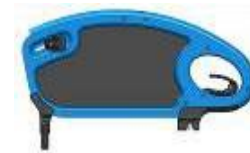
Desk armrest without armpad