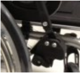
One arm wheel lock