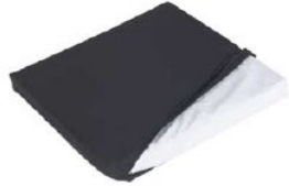
Seat cushion, climate membrane water-resistant, cover with zipper, black