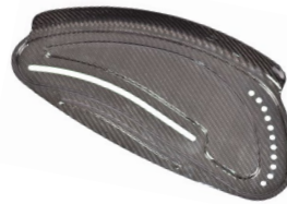
Sideguard carbon with fender