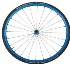
Lightweight wheel, anodized blue