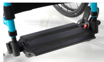
Platform, angle and depth adjustable; flip up, aluminium with locking system