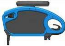
Desk armrest, fixed height, short armpad(25cm)