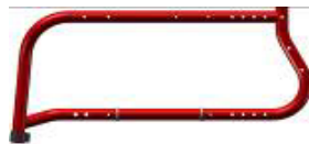
Life FF 85°