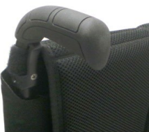
Push handles long