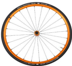
Lightweight wheel, anodized orange