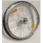
Drum brake wheel