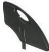
Sideguard composite detachable