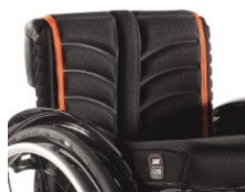
EXO PRO backrest sling