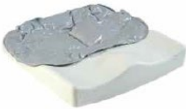
Jay Easy Fluid (picture shown without upholstery)