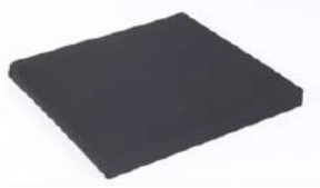
Seat cushion, cover with zipper, black