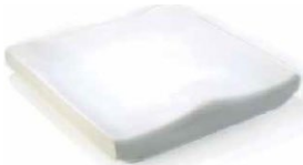
Jay Basic (picture shown without upholstery)