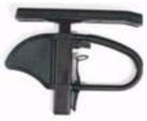
Single post height adjustable armrest