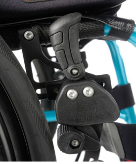
Knee lever wheel lock