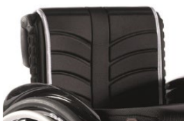
EXO backrest sling