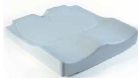
Jay Easy Visco (picture shown without upholstery)