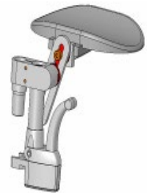
Amputee Support Pad