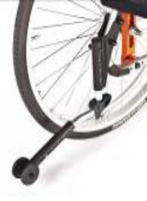
Anti-tip swing away