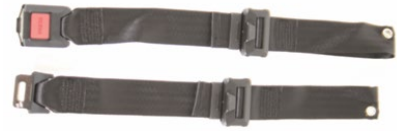
Lap belt with buckle, metal