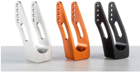
Fork Aluminium, black, orange & silver