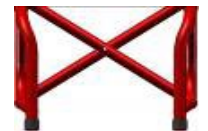
Frame FF 85° (integrated footrest), inset (20 mm on each side), active