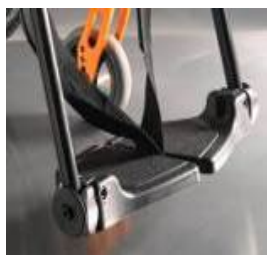
Divided footplate composite