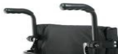
Height adjustable push handles