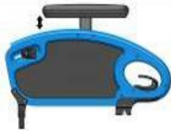
Desk armrest, height adjustable, short armpad(25cm)