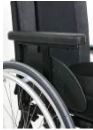
Single-post sideguard, depth adjustable, tool height-adjustable