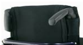
Fold down push