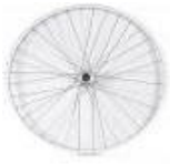
Universal cross spoked