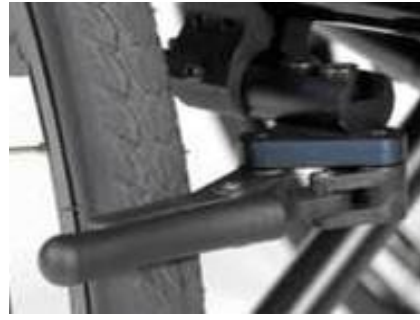
Compact wheel lock