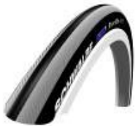
Right Run Tyre