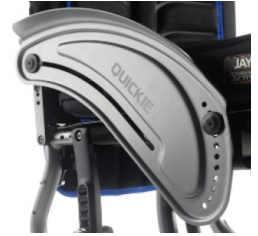
Sideguard alu with fender