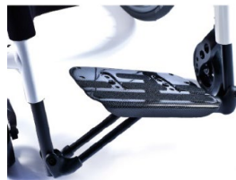
Footboard platform, lightweight, carbon fibre, auto folding