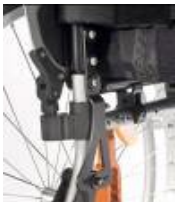
Angle adjustable back -12° to 12°