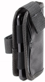
Mobile phone pocket