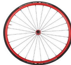
Lightweight wheel, anodized red