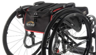
Backrest, fold down (to the front)