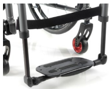
Platform footplate lightweight angle & depth adjustable composite flip up