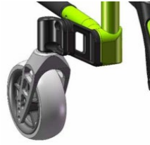
Expansion kit, designed for hemiplegic users