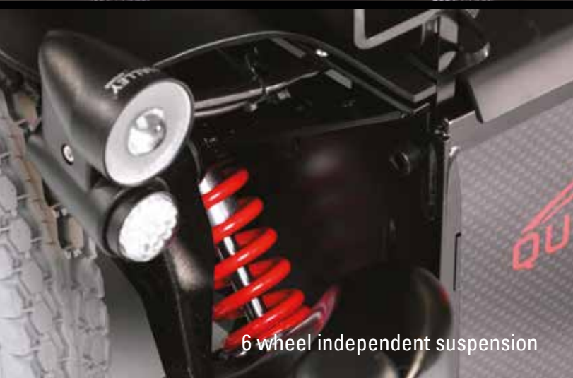
6 wheel independent suspension