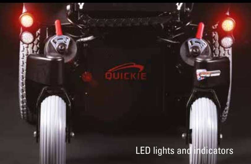
LED lights and indicators