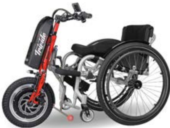
Motor integrated into 14" wheel

Medical Devices Registration No: 1560510