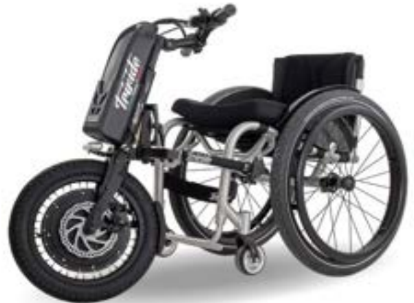
Motor spoked into 16" wheel

Medical Devices Registration No: 1560515