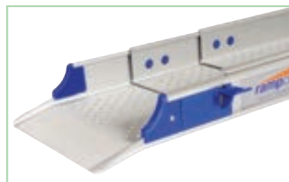
Silent telescopic mechanism with neat safety clip to prevent opening when stored

The most adjustable ramp in the range, these ramps extend up to nearly 3m, yet are extremely compact for easy storage in a vehicle. Available in 2 or 3 section versions to suit your storage requirements.