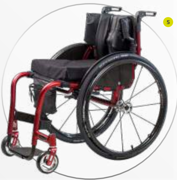
▲ Tukan with Wing Back ILSA and fixed rear axle.

The Tukan A comes with optional adjustability. This ensures a maximum flexibility regarding the individual adjustment of the seating posture. The rear axle as well as the folding back and the footrest can be adjusted continuously.