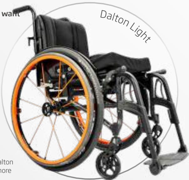
▲ Dalton Light With slimmer frame tubes, resulting in a more elegant look. Max. user weight 80 kg.

Finally, the Dalton is also available with a particularly low seat height. The Dalton L is ideal for users who want to 'walk the chair forward'.