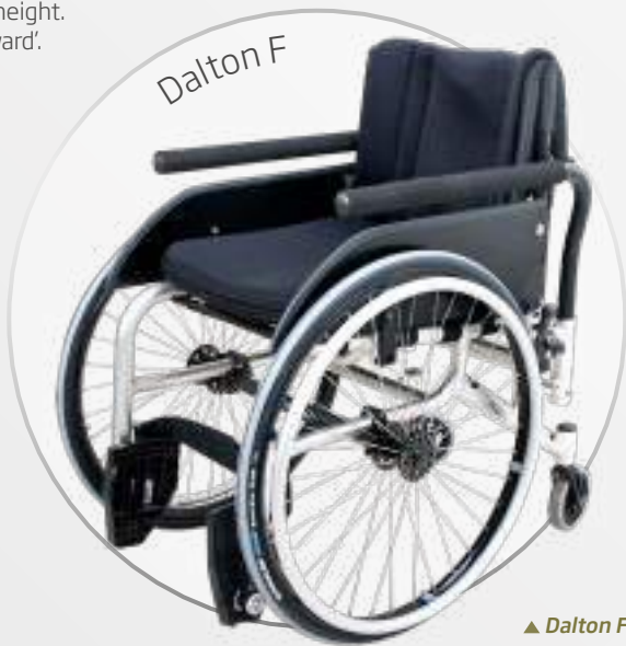
▲ Dalton F Front-wheel drive.