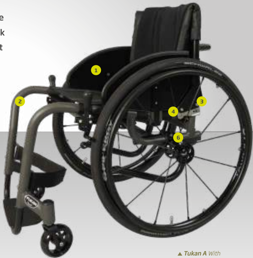
▲ Tukan A With adjustable rear axle.

Adjustable seat and back upholstery ensures ergonomic, upright posture and pressure relief.