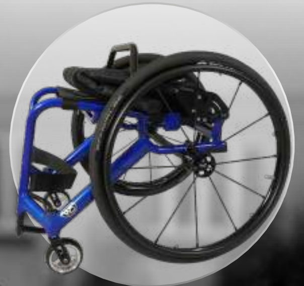
▲ W5 with folding back and adjustable rear axle.