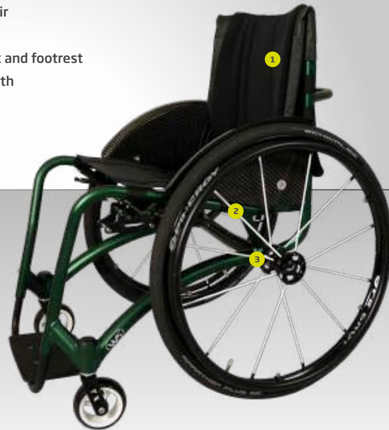
▲ W5 with fixed back and rear axle.

Fixed rear axle ensures strength, rigidity and less weight on the wheelchair. An adjustable rear axle optimises the balance point and enables different seating positions.