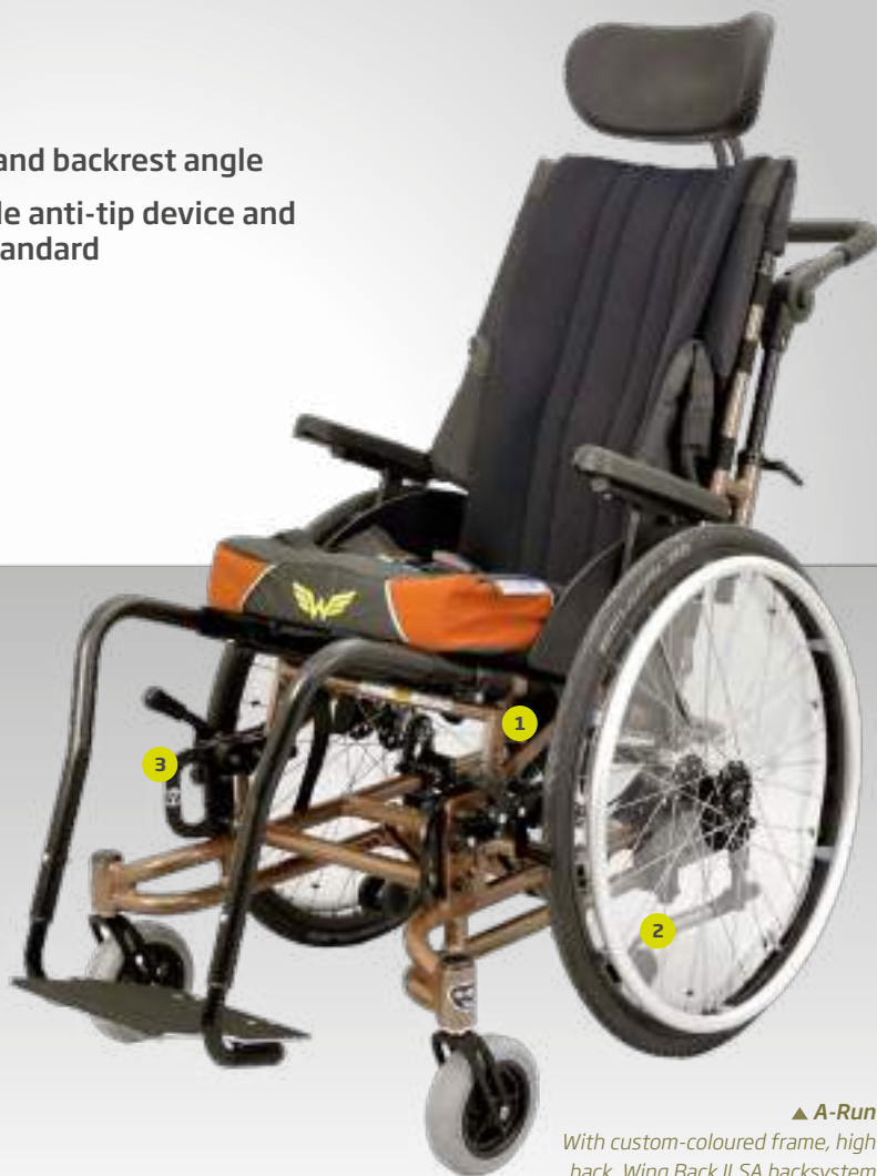
▲ A-Run With custom-coloured frame, high back, Wing Back ILSA backsystem and backwards foldable footrest.